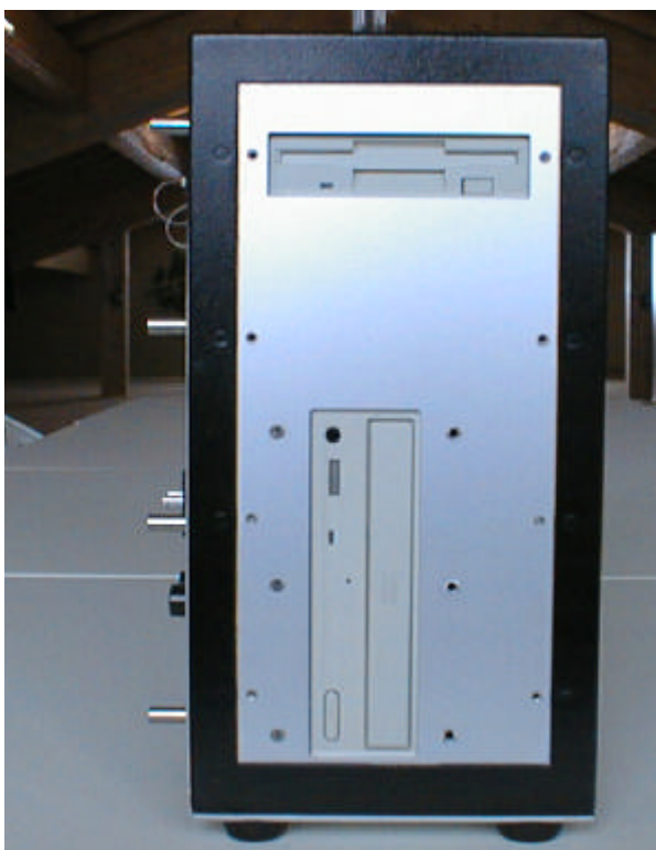
left side with cover sheet